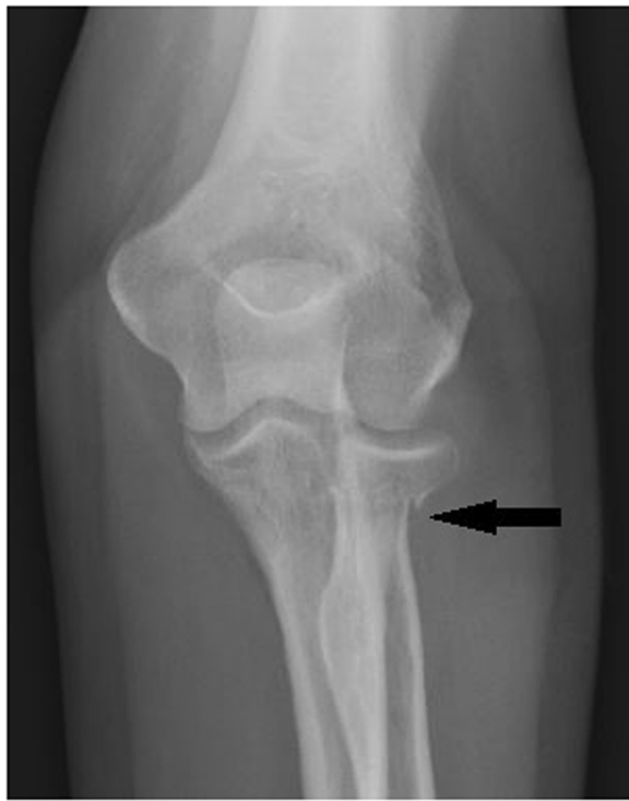
Figure 2 Antero-posterior X-ray elbow view. Note the approximately 2mm displacement of the radial head. Mason Type II Fracture.

Three days post initial consultation, the patient's X-ray results were received from the imaging center and the