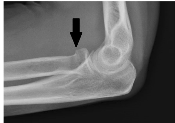
Figure 3 Lateral X-ray elbow view.

patient was referred to a general medical specialist for care. A clinical report and the radiologists report were forwarded to the referred physician. Verbal follow-up with the patient two-weeks later revealed that she had been referred to an orthopedic specialist by her primary care physician. The orthopedist elected not to cast the fracture due to small degree of displacement, lack of significant swelling, and range of motion within normal limits. She was restricted from performing any weight bearing exercise and was instructed to return in one month for follow-up X-ray to assess the healing of the fracture site. At four-weeks following the initial evaluation, a repeated radiographic examination demonstrated healing of the fracture site. At three month telephone follow-up the patient reported full use of her elbow with no pain in any ranges of motion.